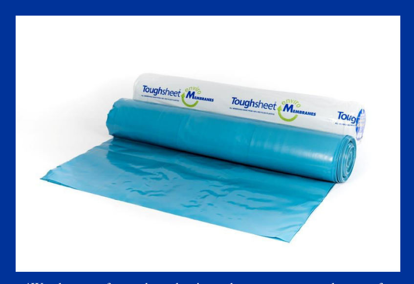
*We also manufacture bespoke sizes, please contact our sales team for a quote