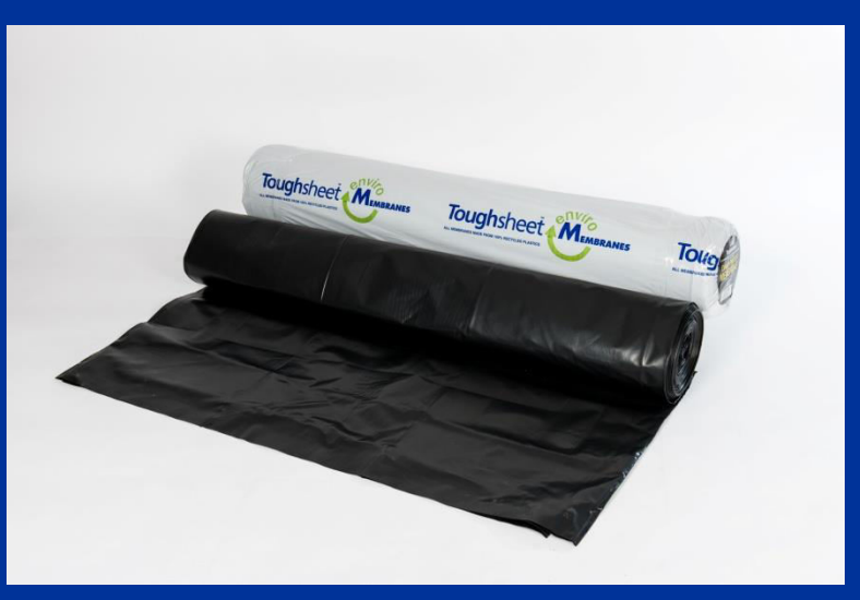
*We also manufacture bespoke sizes, please contact our sales team for a quote

Our much praised record producing DPM's and a continuous investment programme has produced a comprehensive range of high quality damp proof membranes.