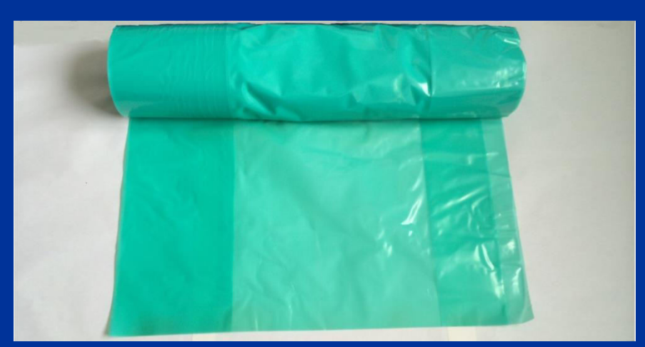
* All our Data Sheets can be found at www.Toughsheet.co.uk