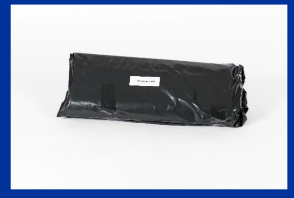
* All our Data Sheets can be found at www.Toughsheet.co.uk

Polythene Rubble Sacks for disposal of any heavy duty waste or for storage of most building supplies such as sand or cement.